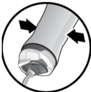
SQUEEZE TO DRINK