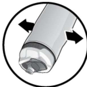
RELEASE TO SEAL